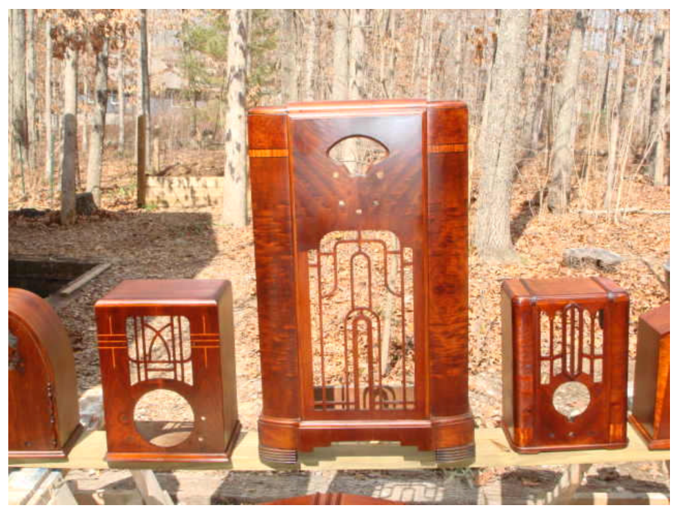
Here is a close-up of some of the cabinets I sprayed on a perfect weather day. You can see the deep shine even in this photo.

Mixing Multiple Stains: Let's say you have prepared the surface and stained and filled the wood, and sprayed a coat or two of lacquer, but you aren't quite happy with the color of the radio—you might like it slightly darker. Take some of the stain you used, mix it with the Deft