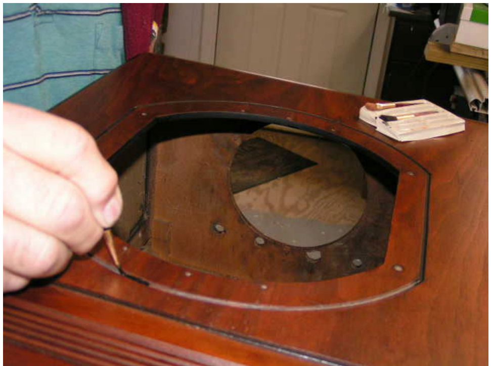
Applying gesso to a speaker grille.

Special Effects: Another way to achieve a "blended finish" is to use an air gun to spray lacquer tinted with the stains I mentioned. An air gun is simply a much smaller version of a paint spray gun; it puts out much smaller patterns of spray and allows for exact placement of the colored lacquer. An air gun provides precise control over the application of stains, stain and lacquer mixtures, and clear lacquer for small applications. If you have seen feathered finishes where a darker finish bleeds off or blends into the surrounding finish, chances are it was done with an air gun. Air guns use very low air pressure and volume and can even be powered