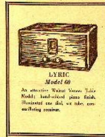
LYRIC Model 88 An attractive Walnut Veneer Table Model: hand-cabinet piano finish. Illustrated one dial, six tubes, com- pact receiving receiver.

Please send me additional literature. I am interested in the following models: Name _____ Address _____ City _____ State _____