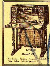
LYRIC Model 84 Hardwood Spanish Curved Cabinet Eight Tubes, Built-in speaker

120 West 42nd Street Between Broadway and Sixth Avenue