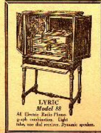
LYRIC Model 85 All Electric Radio-Phono- graph combination. Light tube, one dial receiver. Dynamic speaker.